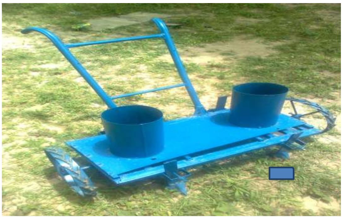
Figure2. The combined (maize and soya bean) seeds mobile planter